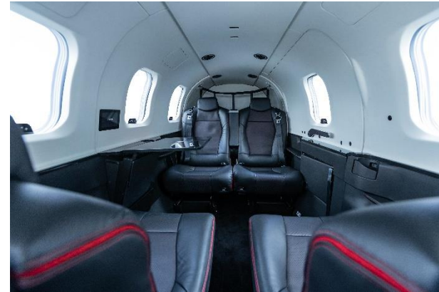
Prestige Cabin: An all-new Environmental Control System & LED Ambience Strip Lighting