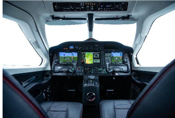
Precise & Clear Flight Deck